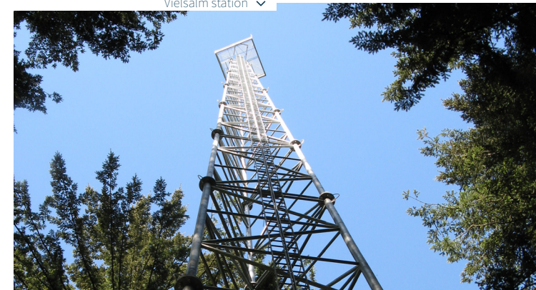
Vielsalm station v