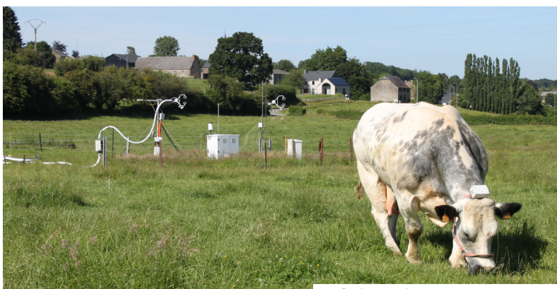
^ Dorinne station

Upgrade in 2014 and expected official integration in ICOS in 2018.