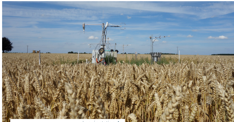
Loncée station ^